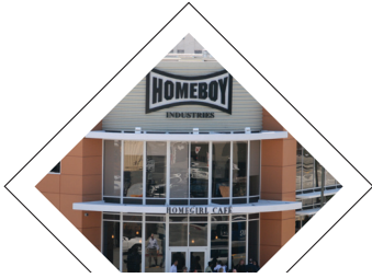
Hope has an address.