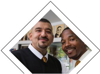
Donations and volunteer support are integral in helping us directly impact lives every day.

Our revenue increased slightly over last year and was sufficient to offset our costs. The largest component was our social enterprises, led by Homeboy Bakery and Homegirl Catering. We are grateful for government support from the Department of Labor and the City of L.A.’s Gang Reduction Youth Development program (GRYD) and our generous private funders.