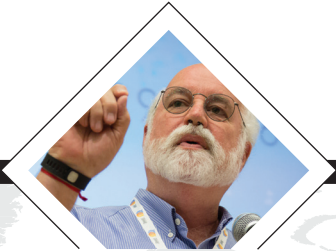
Throughout our 29 years, we have become leaders in what it means to help the least likely to succeed.