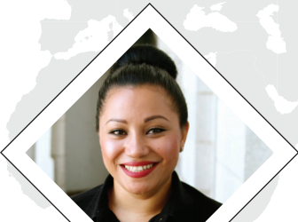
Kinship, mutuality and celebration are integral parts of the Homeboy Industries’ model.